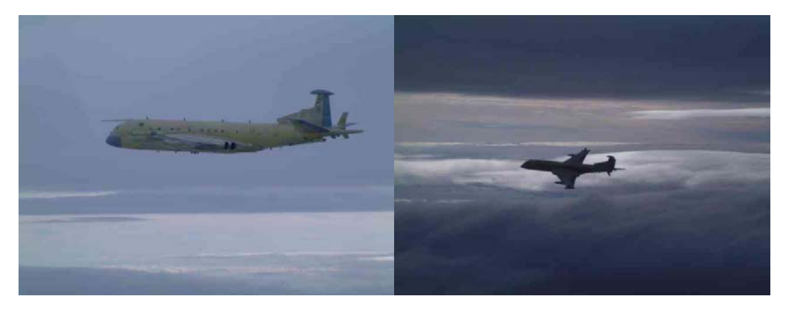
Figure 6 Nimrod MRA4 PA01 flaps & gear up during flight 1.

At the time of writing, PA01 has recommenced flight trials after completion of Ground Resonance Testing. It's priority tasks will be high and low speed flight envelope expansion – primariy flutter, handling and stalling. PA02 is currently at Norwich Airport for painting before flying to Woodford for an engineering upgrade pause. PA03 is currently being prepared for engine ground running.