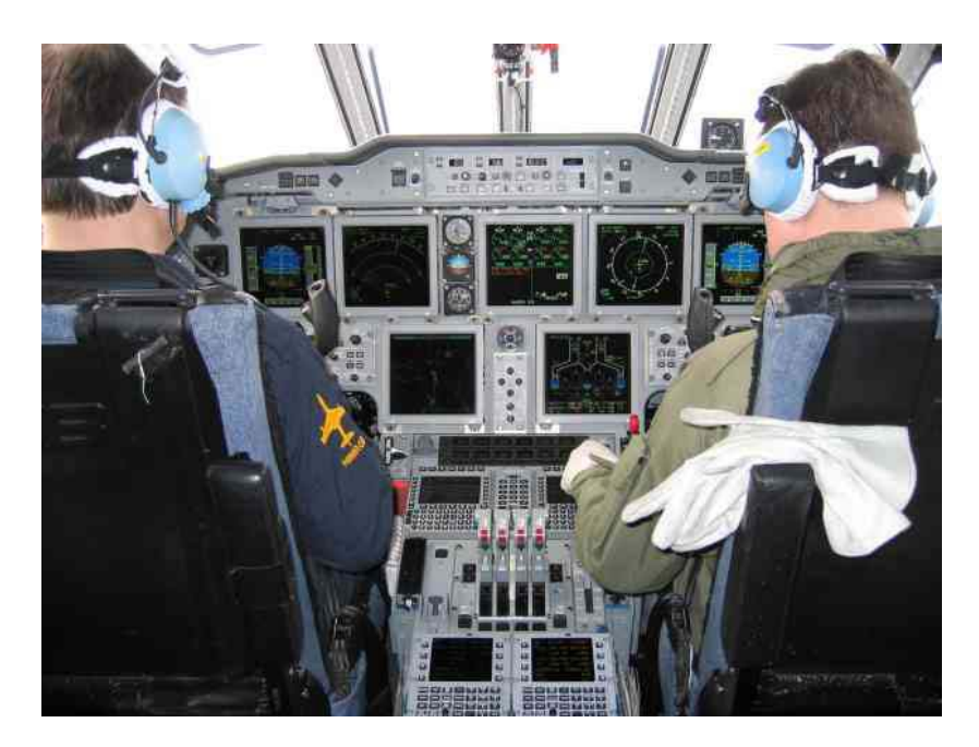
Figure 7 Nimrod MRA4 PA02 Flight Deck

The Nimrod MRA4 offers a high degree of flexibility for conducting flight test operations. It has the proven data telemetry system developed and used by the UK fast jet programmes but it also has an onboard data analysis suite in the cabin of the aircraft. This allows it to exploit the best of both fast jet and heavy aircraft real time test methodology. The data analysis software is common to both the onboard workstations and the telemetry grounds station, so the engineers have the same displays and tools available wherever they're located. The intent being to make the transition from onboard to telemetry data analysis as seamless as possible. Indeed, crew intercom is broadcast as part of the encrypted telemetry data stream (termed 'hot mic') so FTE's in telemetry are really just an extension of the aircraft crew.