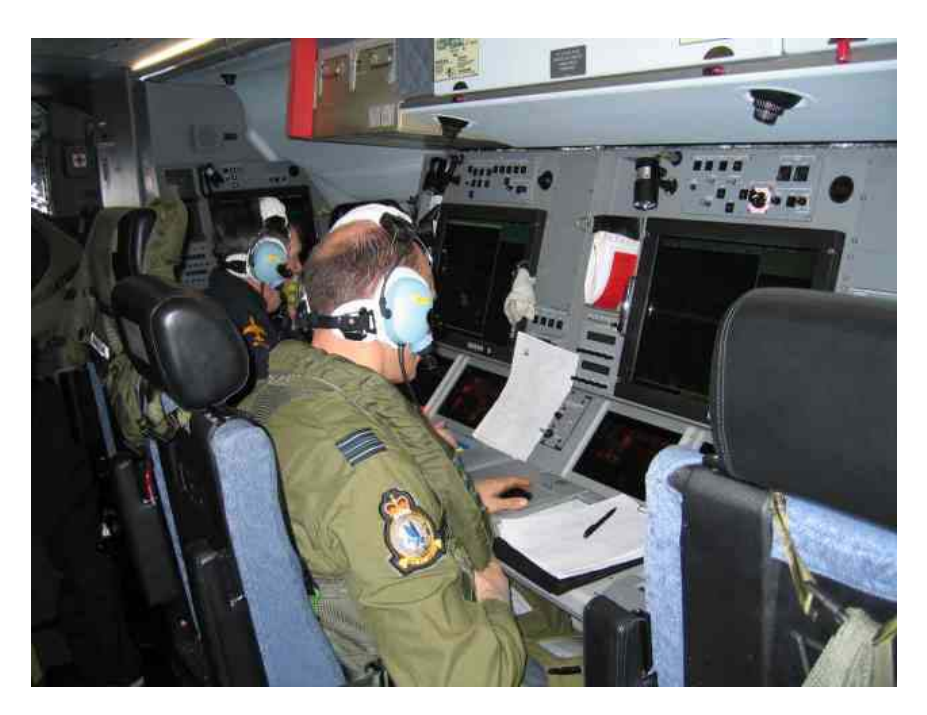
Figure 8 Nimrod MRA4 PA02 Mission Deck (TACCO & Comms Op)

All flight trials are assessed and categorised for risk and graded as Low, Medium or High, depending on the inherent hazards. The crew constitution is managed via the Flying Order Book, taking due account of the risk categorisation of the flight.