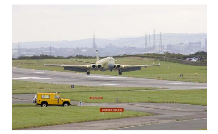
Figure 4 Nimrod MRA4 PA01 lands on Warton runway 26 at the conclusion of Flight 1

In flight experience also confirmed the pre-flight handling and performance predictions, both from modelling and flight simulation – the aircraft behaved exactly as expected.