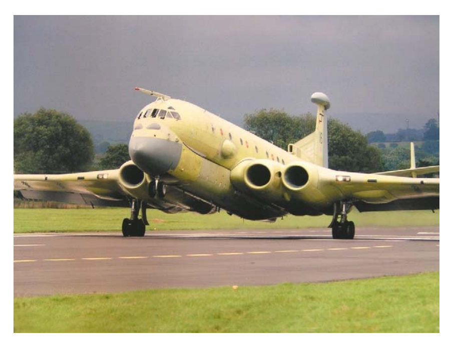
Figure 1 Nimrod MRA4 PA01 During High Speed Taxy Trials

This paper is to give an overview on the progress of the Nimrod MRA4 flight trials and highlight the innovative methods being used to deliver an efficient and affordable flight test programme.