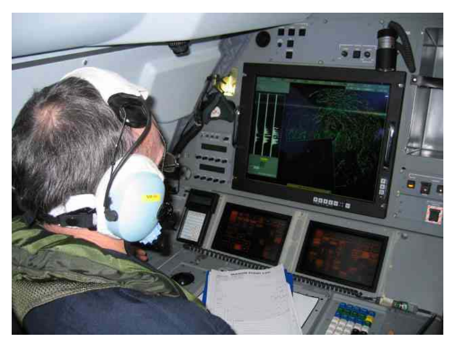
Figure 9 Nimrod MRA4 PA02 Mission Deck (Radar Op)

Consequently, the concept of operations has to be flexible enough to account for the crew required to perform the test plus respecting the need to minimise the number of people exposed to the risks of test flying.