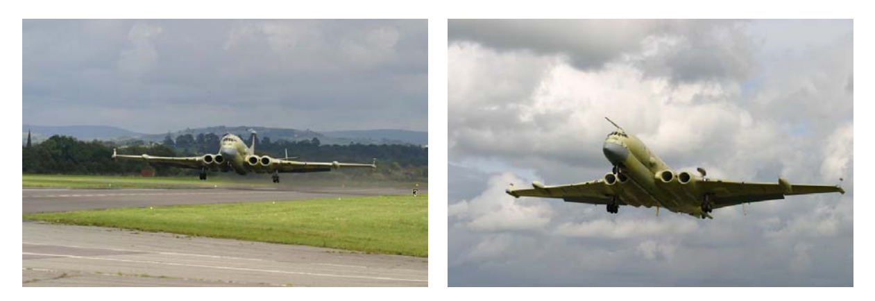
Figure 2 Nimrod MRA4 PA01 takes off from Woodford runway 25 on flight 1.

The aircraft was accompanied by a Pilatus PC-9 and a BAe Hawk T1 chase aircraft throughout and first flight concluded after two hours airborne with a successful landing on runway 26 at BAE Systems flight test centre at Warton.