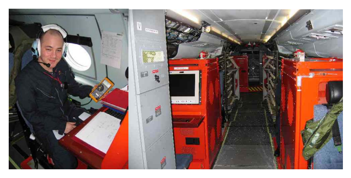
Figure 10 Nimrod MRA4 PA02 onboard FTE Workstations

The aim with mission systems operations is to emulate the proven processes for air vehicle trials, again to make the transition between AV and MS flying as seamless as possible.